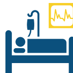
TERMINAL ILLNESS BENEFIT