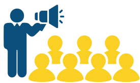
QUARTERLY TOWN HALLS