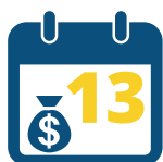
BUILT-IN BONUS - 13TH MONTH PAY (DCX PROVIDED)