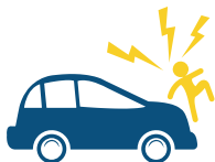
ACCIDENTAL DEATH/DISABILITY INSURANCE