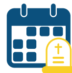
BEREAVEMENT ASSISTANCE & LEAVE