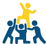
TEAM BUILDING ACTIVITIES