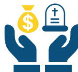
BENEVOLENCE FUND / EMPLOYEE ASSISTANCE PROGRAM