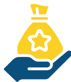
REWARDS PLATFORM FOR PARTNERS TO GIVE BONUSES