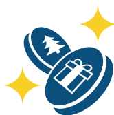
ANNUAL CHRISTMAS GIFT