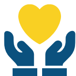
DCX CARES PROGRAM