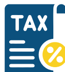
MANDATORY PH PAYROLL TAXES