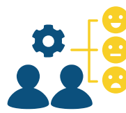
EMPLOYEE ENGAGEMENT SURVEYS