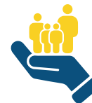
FAMILY ASSISTANCE BENEFIT