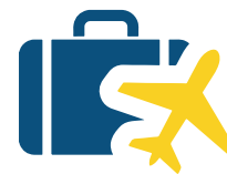
TRIPS TO THE PHILIPPINES FOR OUR CLIENTS