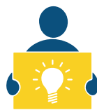
WEEKLY INSPIRATION POSTS, COMPETITIONS & MORE