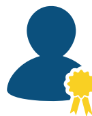
DCX-CELLENCE AWARDS, EMPLOYEE COMMENDATIONS & RECOGNITIONS