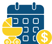
MATERNITY BENEFITS - 105 DAYS OF PAID LEAVE