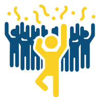
TWICE-YEARLY COMPANY PARTIES