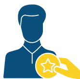
MONTHLY EMPLOYEE APPRECIATION HOURS