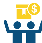
QUARTERLY DCX BUSINESS PERFORMANCE BONUS