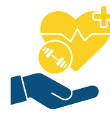
HEALTH & WELLNESS PROGRAM