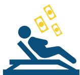
GENEROUS PTO - 1 DAY FOR EVERY MONTH ACCRUED & CONVERSION TO CASH/CARRY OVER UP TO 7 DAYS