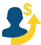
GUARANTEED ANNUAL RAISE